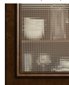
Cross Reeded (CRD)